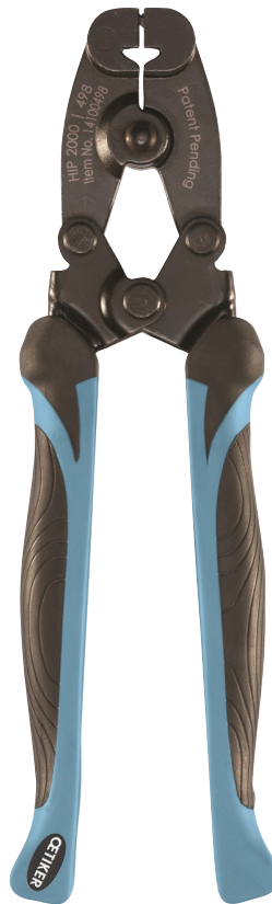
Compound Action Pincer - Side Jaws - Straight Handles HIP 2000 | 498