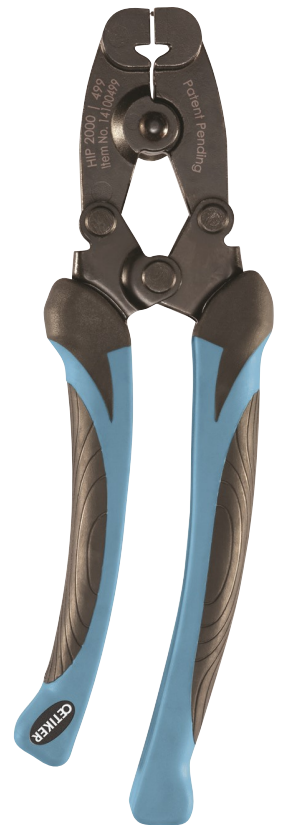
Compound Action Pincer - Side Jaws - Curved Handles HIP 2000 | 499

Compound action tools: provide high closing forces + require less hand strength for a safe and simple closure + superior quality design + one tool covers a wide range of ear clamps