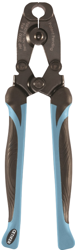
Compound Action Pincer - Standard Jaws - Straight Handles HIP 2000 | 496